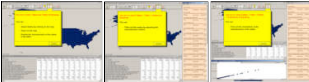
Figure 1: Three different levels of the multi-layered approach, (a) the first level shows only the map and the data table (b) second level shows slider bar along with map and table (c) the third level adds scatter plot. A yellow introduction panel lists the features of the level and indicates the location of the level buttons.